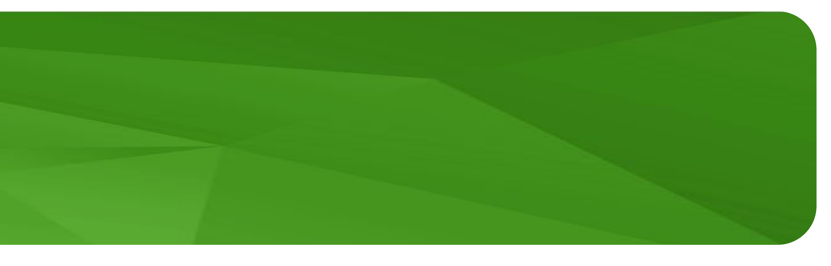
Table 2. THS Post-market Passive Safety Surveillance.